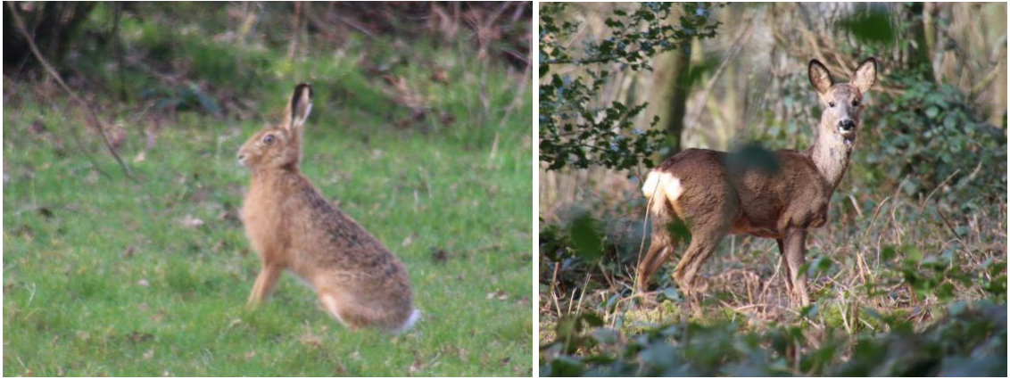
Carole Thelwall-Jones took these lovely photos locally of hare and a roe deer