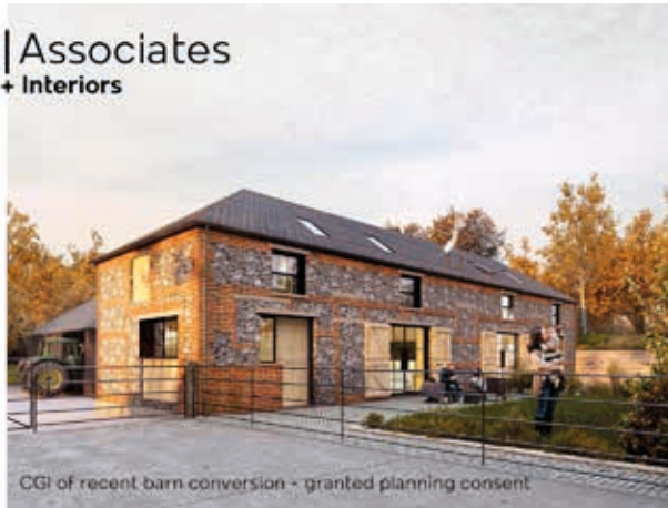
CGI of recent barn conversion - granted planning consent

07743 448 425 mhumphreysassociates@gmail.com