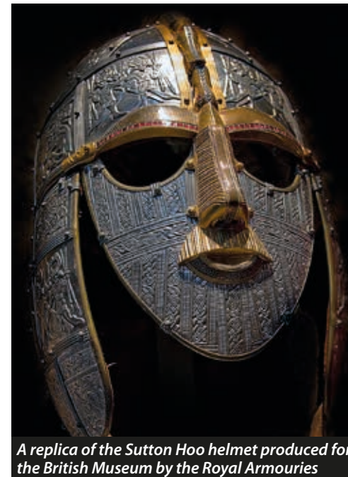
A replica of the Sutton Hoo helmet produced for the British Museum by the Royal Armouries