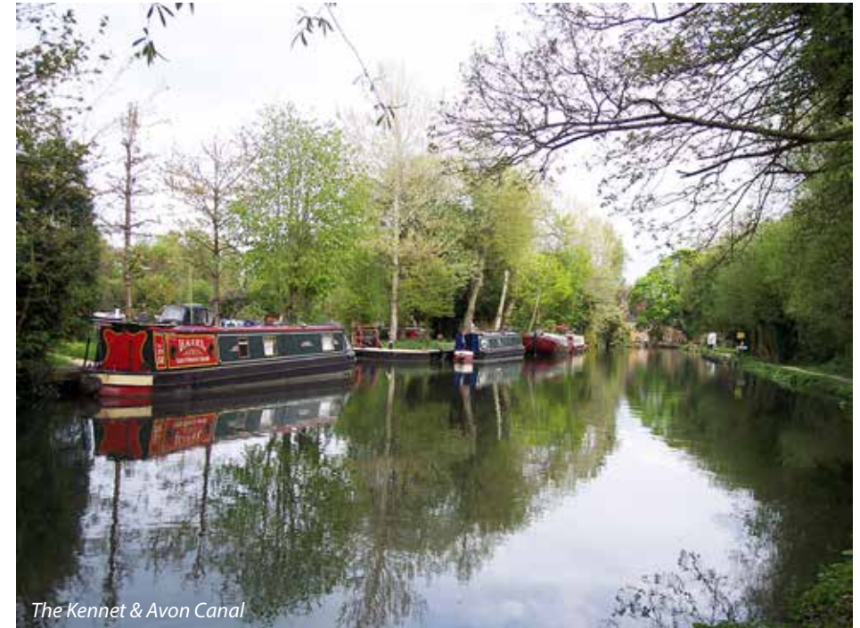
The Kennet & Avon Canal

The talk was about the canals of Great Britain. She started by telling us about their first experiences, which were not very promising – with everything going wrong that could have gone wrong!